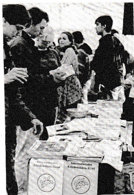
Participants peruse IPB literature at a national youth conference in Germany.