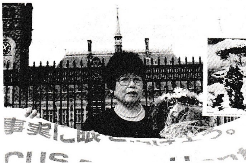
Japanese Hibakusha outside the International Court of Justice, the Hague, July 1996