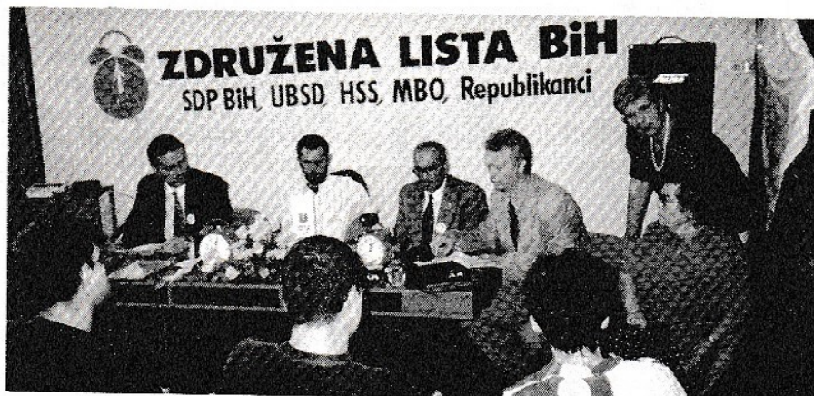
MacBride Prize press conference, Sarajevo, August 1996

During the course of a year the secretariat deals with innumerable requests from journalists for information, documentation, interviews and contacts. One example is the footage filmed by NHK TV on the subject of the World Court Project. This involved several visits to the UN, interviews, flying in a special banner from New Zealand, and recreating a lobbying meeting of several years earlier. Another was the interview filmed in our office by a French TV channel on the subject of our international nuclear testing